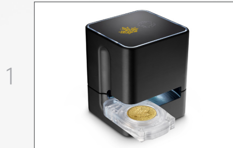
STEP 1: Insert the coin into the Bullion DNA Reader.

The authentication process takes just moments to complete: